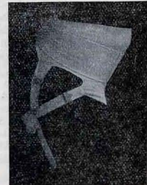
Woman's Belt—Side View