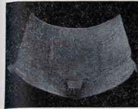
Woman's Belt—Front View

plastic operations and in conditions of irritable bladders to support the weight of the viscera. The invention which took the prize offered by the Managers of the Woman's Hospital of Philadelphia.