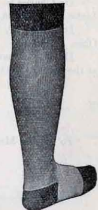
New Style "Hornbro" Seamless

Trusses, Abdominal Supporters, and Surgical Appliances HORN'S STANDARD MEANS QUALITY