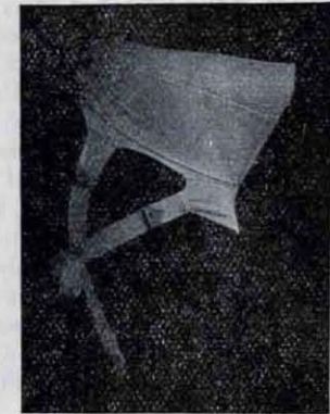
Woman's Belt—Side View

The "Storm" Binder may be used as a SPECIAL support in cases of prolapsed kidney, stomach, colon and hernia, especially ventral and umbilical variety. As a GENERAL support in pregnancy, obesity and general relaxation; as a POST-OPERATIVE Binder after operation upon the kidney, stomach, gall-bladder, appendix or pelvic organs, and after