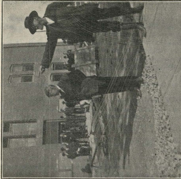
The Present and Future Heads of Osteopathy. The Old Doctor directing improvements around the School.

and the cure was to encircle the throat with a string of amber beads. This is a very prevalent treatment in Russia, he said. Given for what it is worth, but given as it occurred.