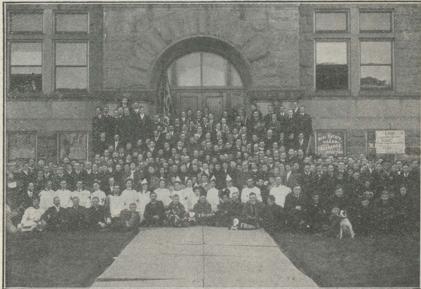
SOME OF THOSE IN THE HOSPITAL PARADE.