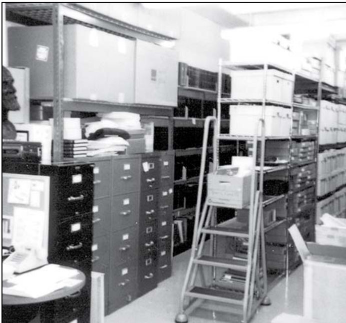
Back portion of the NCOH Collection Area, October 1997

First, after completing the move into the new ICOH, the Museum will initiate plans to expand our gallery space over the next several years. This expansion will include moving the director's office inside the Museum, reducing the size of the meeting room, and clearing walls to reconfigure our gallery layout. Secondly, the overall improvements will push us several significant steps closer to accreditation by the American Association of Museums. By creating larger and better artifact storage areas, expanded user-friendly research facilities, upgraded offices and exhibit space, and establishing enhanced operational protocols, we will be closer to our ultimate goal of accreditation.