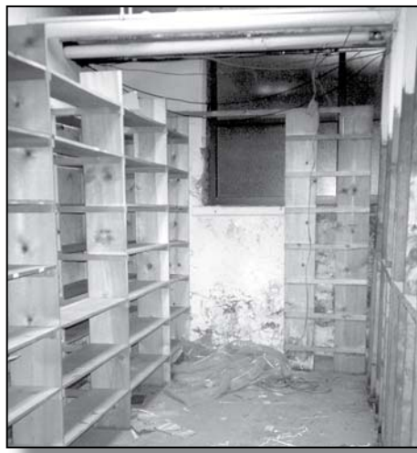
In 1997 ATSU offered the Museum artifact storage space in the basement of Memorial Hall; however, the offer was declined due to environmental concerns.

Originally consisting of only two glass display cases in the main lobby of Memorial Hall, the first effort to create an osteopathic museum began in 1934 on the campus of the Kirksville College of Osteopathy and Surgery (known today as ATSU-KCOM). Over the ensuing years, a growing backlog of artifact donations prompted caretakers to take several steps toward increased funding and visibility, and by 1978, they began searching for a larger facility. In 1980 the collection was moved into its first consolidated location, occupying half of the Oklahoma Building, a small clinic building located on Fourth Street, directly adjacent to the birthplace cabin and the first school.