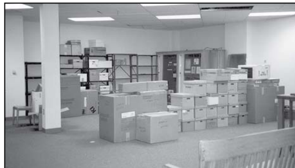
Back portion of Museum's main gallery, April 1995

Since we receive a constant stream of donations — often as many as 1,200 to 1,500 a year — we have to design our storage spaces as efficiently as possible. By estimate, we have been beyond maximum capacity since 2004.