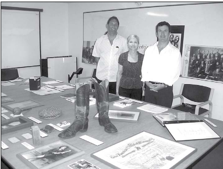
Museum exhibit with faculty at Southern Cross University in Lismore, Australia