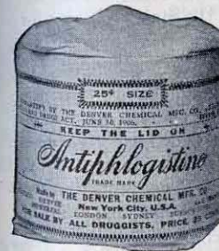
(New 25-cent Size)