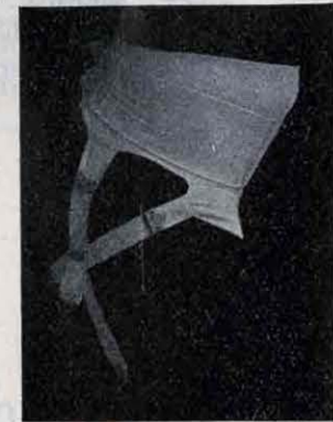
Woman's Belt—Side View