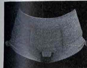
Woman's Belt—Front View

The "Storm" Binder may be used as a SPECIAL support in cases of prolapsed kidney, stomach, colon and hernia, especially ventral and umbilical variety. As a GENERAL support in pregnancy, obesity and general relaxation; as a POST-OPERATIVE Binder after operation upon the kidney, stomach, gall-bladder, appendix or pelvic organs, and after